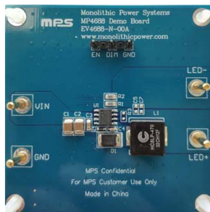
Components Area: 0.66" x 1.17" (1.7cm x 3cm)