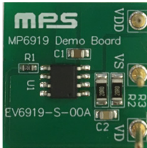
(L x W) 2.2cm x2.2cm